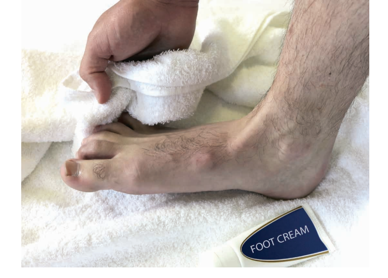
Dry your feet and don't forget between your toes. If your skin is dry, apply a moisturising cream daily, but not between the toes. This can increase chances of tinea (athlete's foot).