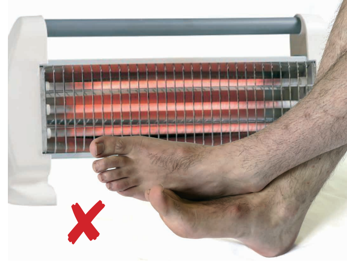
Be careful with heaters and hotwater bottles – if you have loss of feeling it could cause you to burn your feet and not realise. Hot water could burn your feet too – always check the temperature with your elbow before you get in a hot bath.