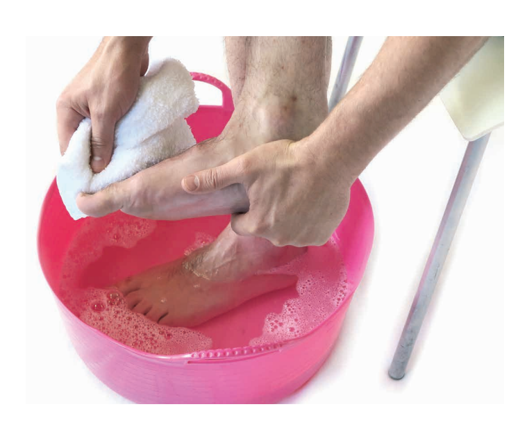
Wash your feet every day.

The good news is that many of these foot problems can be avoided by daily foot care. Follow these steps to help prevent foot problems.