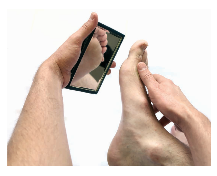
Check your feet daily. Use a mirror or ask someone to help. Look for changes to your skin. Cover any cuts or blisters and change the plaster each day. If it does not start healing or gets red or sore or smells see a doctor straight away.