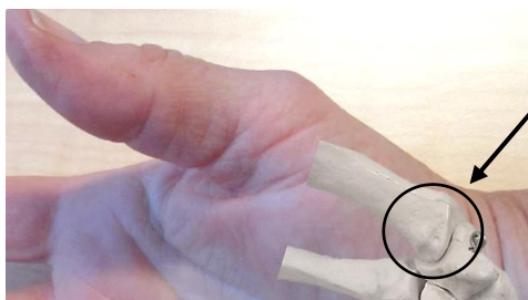
The shallow, saddle-shaped bone ends of the thumb base joint.

The thumb gives humans an amazing ability to use tools and create our world. The thumb base joint is a small joint that we put under a lot of force. It has two shallow, saddle-shaped bone ends shaped like a rider on a saddle.